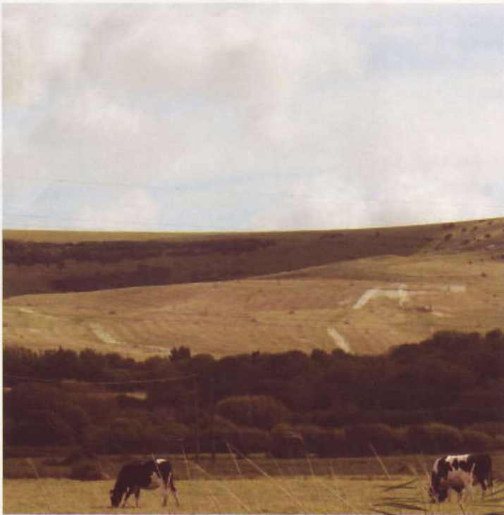
Restoration of Beddingham Landfill in the South Downs National Park

If these go ahead the whole road connection to Ashdown Brickworks will not be available until well into the 2020s when it is anticipated that demand for land disposal will be at a low ebb. So it is not proposed to keep the site specific allocation in the Waste Local Plan.