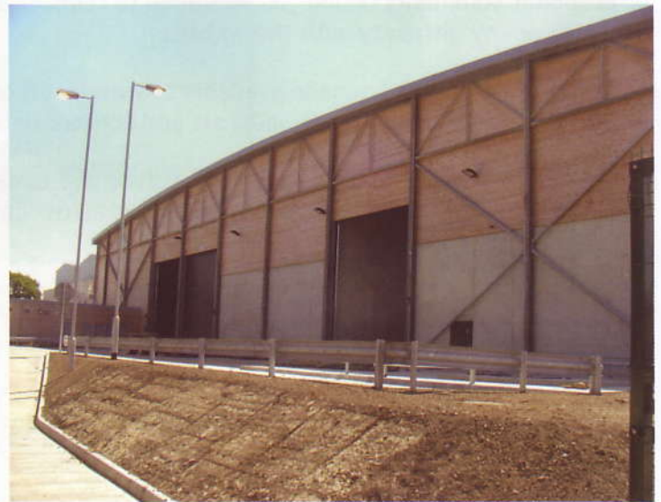
Composting at the Woodlands Centre, Whitesmith

The previous consultation looked at sites within our own area only. These have been found not to be feasible. In reality, waste moves between areas within the South East and for this reason we have been taking a wider view. There are landfill sites elsewhere which could take our waste in the short term but other solutions are also needed.