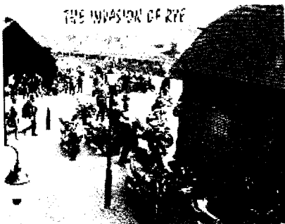
Bikers surround Rye Heritage Centre on Monday